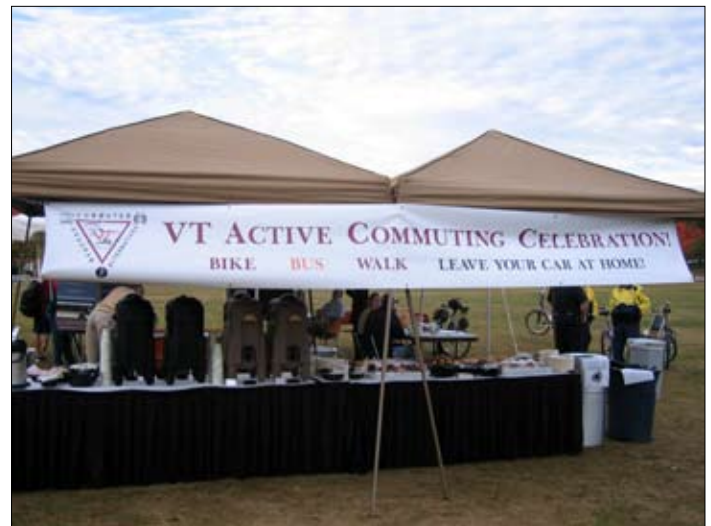
Active Commute Day 2007

This year, East Coasters Cycling, CommonHealth, Blacksburg Transit, the Smart Way Bus and RIDE Solutions provided information related to their services. And, the Virginia Tech Police Department registered more than 30 bikes.