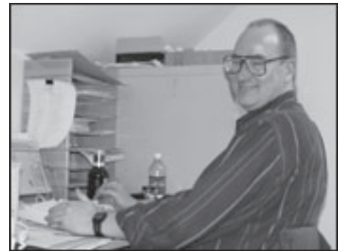
SPECIAL EVENTS COORDINATOR

Remaining home games are Feb. 21 and 24.