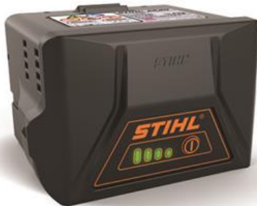
Table 3: Decibel Changes, Loudness, and Energy Loss

https://blacksburgpower.stihldealer.net/products/batteries-and-accessories/batteries/ak20/